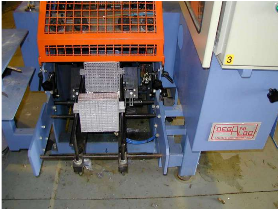
Casted grid size 183x175x3,7

The latest and more interesting innovation regards the wide range of grids cast by our machine. Thanks to the new updating, we have achieved the important goal of obtaining grids usually cast by industrial casting machine. Our standard grid-casting machine is now able to produce single grids till a size of 183x320 mm or double grids till a size of 183x155 mm, both of a thickness up to 4 mm.