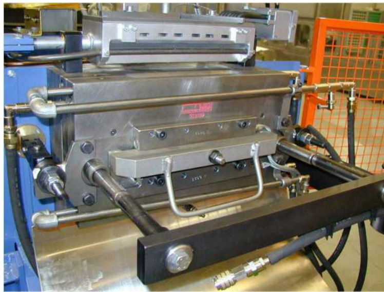
Ladle and Mould

The feeding system has been designed with special accuracy on avoiding mechanical troubles.